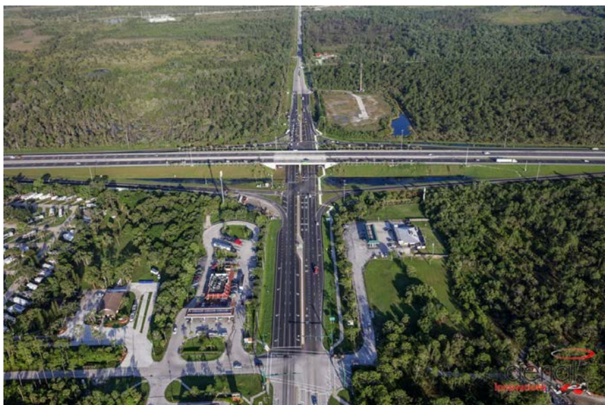
Interchange at SR-9/I-95 and CR 512 in Indian River County